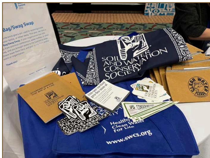
Bringing the SWCS brand to the swag swap.