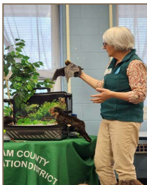
Perry presenting the Planting Hope Demonstration