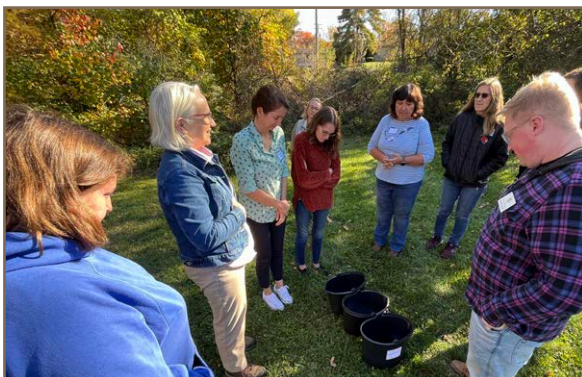
Perry leading a debrief on a watershed simulation at the morning Project WET for Educators workshop