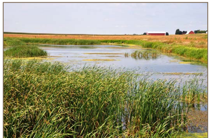
A CREP wetland in Palo Alto County, Iowa. CREP, the Conservation Reserve Enhancement Program, is a major state/federal initiative to develop strategically located wetlands using advanced computer technology and designed to remove nitrate from tile-drainage water from cropland areas.

In 2018 we unveiled a new multimedia resource on the SWCS website called the Conservation Media Library . The Library showcases conservation happening on the ground and is currently focused on cover crops, drainage water management, saturated buffers, prairie strips, bioreactors, and most recently, wetlands . By adding wetlands to the Library, we hope to provide more awareness of the conservation benefits of this practice, as well as provide resources for you to use when communicating about wetlands.