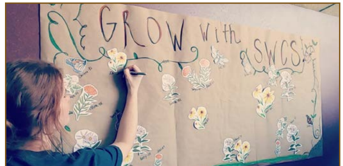
When you donate, your name is added to our prairie at headquarters. Help our giving garden grow with a donation today!

Donations can be made online at swcs.org/give , by phone at 1-800-THE-SOIL (1-800-843-7645), or checks can be sent to 945 SW Ankeny Rd., Ankeny, IA, 50023. Thank you!