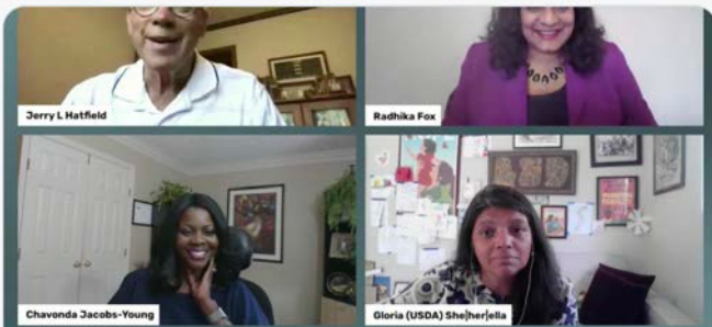
Climate Change Mitigation and the Role of Working Lands