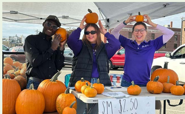
Members of the Kansas State University Soil and Water Conservation Society Student Chapter.