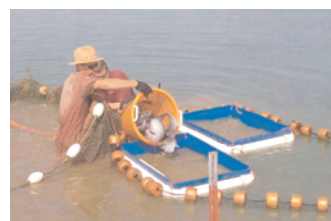
Fish harvest during the technical tour