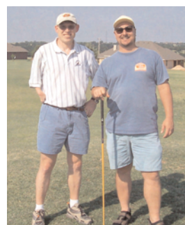
1st Place golf team