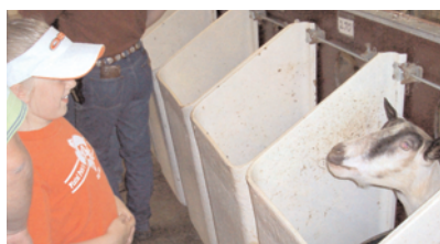
Jabree Wood meeting a new friend

The conference concluded Friday morning with the technical tour held at Langston University. The first stop was at the aquaculture research ponds. The group learned about the research being conducted and got to watch fish being harvested from one of the ponds. The next stop was at the E. Kiki De la Garza American Institute for Goat Research. After touring the goat research facilities we were given the opportunity to sample goat milk ice cream, goat cheese, and goat meat jerky. The final stop was at the buck performance test where we saw the automatic scales and feeders used for the testing.