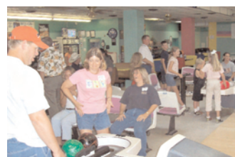
Family night at 89er Bowl